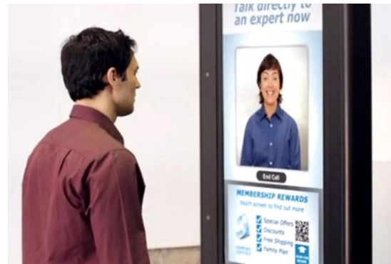
MediaCast Video Presence adds intelligent video call routing to interactive digital signage solutions enabling live 2-way video conversations when and where they are needed most.